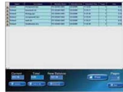
Print Release Station user screen with jobs.

To print, patrons enter their method of payment (cash or card) into the payment device, select their print jobs and click 'print' to release to the defined printer. Print Manager tracks the total cost for print jobs, total number of pages to print and after the job is released, displays the remaining balance.