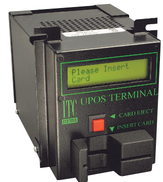
Smart Card Stored Value model 2020