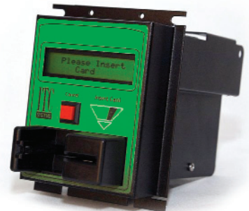
NetLink Online Terminal model 7020